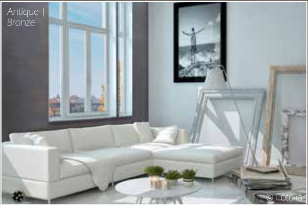
Antique | Bronze

Through the combination of old bronze and anthracite with ornaments the refuge becomes a real optical highlight. The elegant bridging provides harmonious elegance and refines any room with a unique, creative antique look.