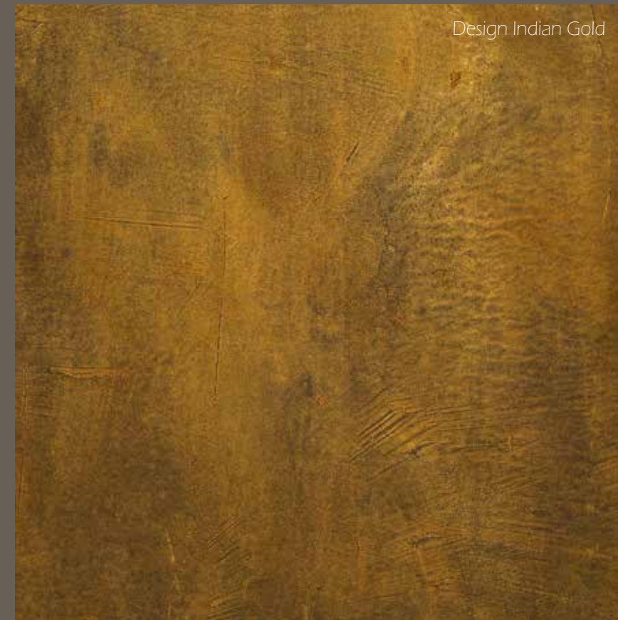
Design Indian Gold