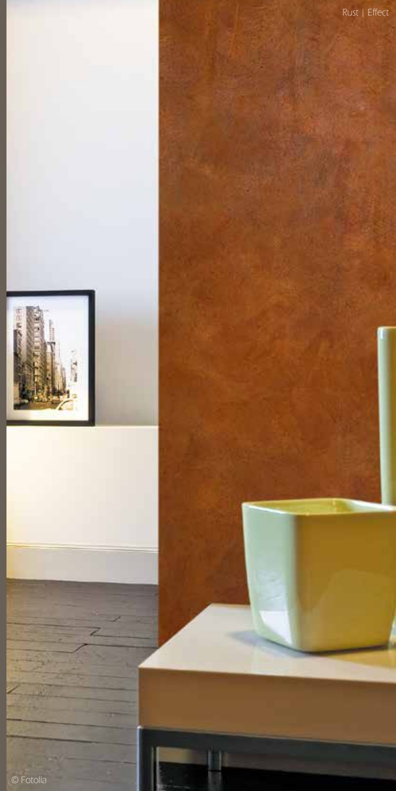
Rust | Effect