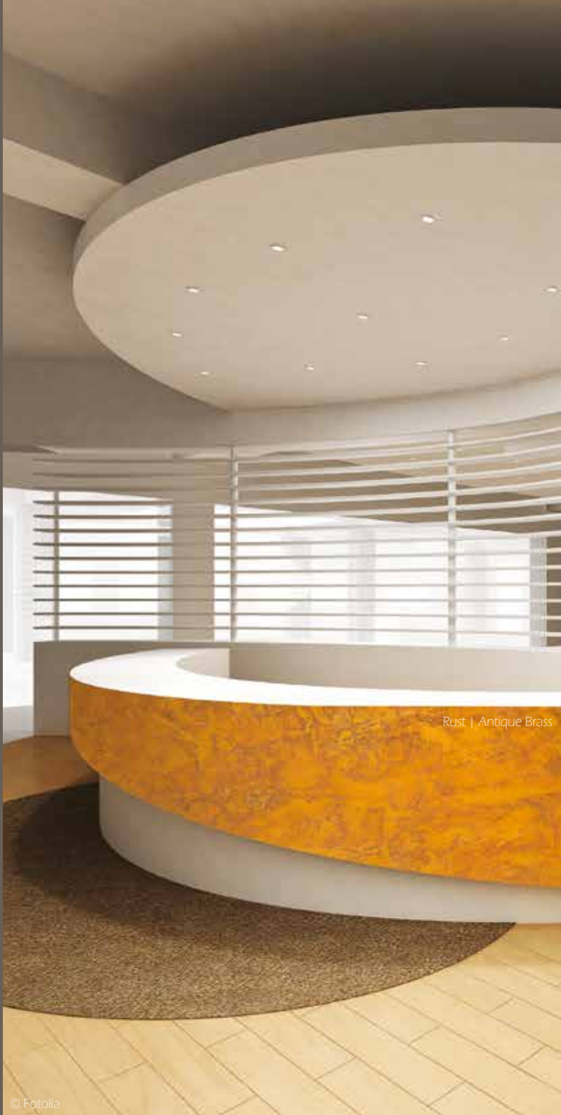
Rust | Antique Brass

The variation of rust and gold creates an luxurious and sensual ambiance. The individual composition and the specific reflecttion behavior of the materials cause special effects in optics and gives the surface an additional artistic expression.