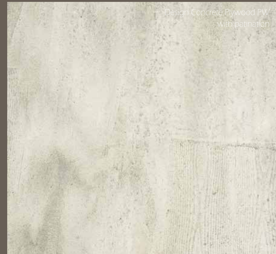
Design Concrete Plywood PW with patination