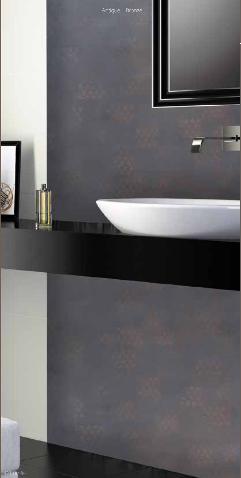
Antique | Bronze

2.8 x 1.0 m plus appr. 5 % oversize in length