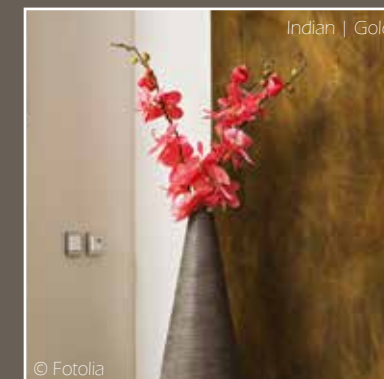
Indian | Gold