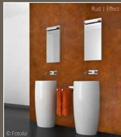
Rust | Effect