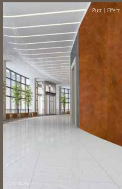
Rust | Effect

2.8 x 1.0 m plus appr. 5 % oversize in length