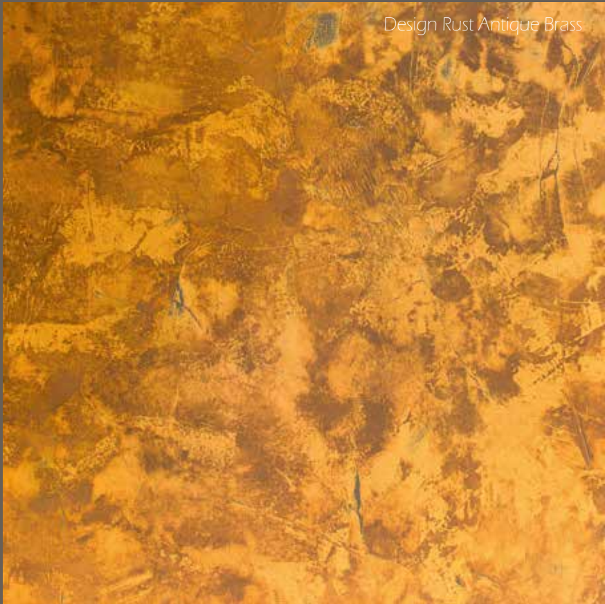
Design Rust Antique Brass

Textures of various natural ingredients Unique | handmade