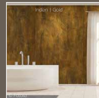
Indian | Gold