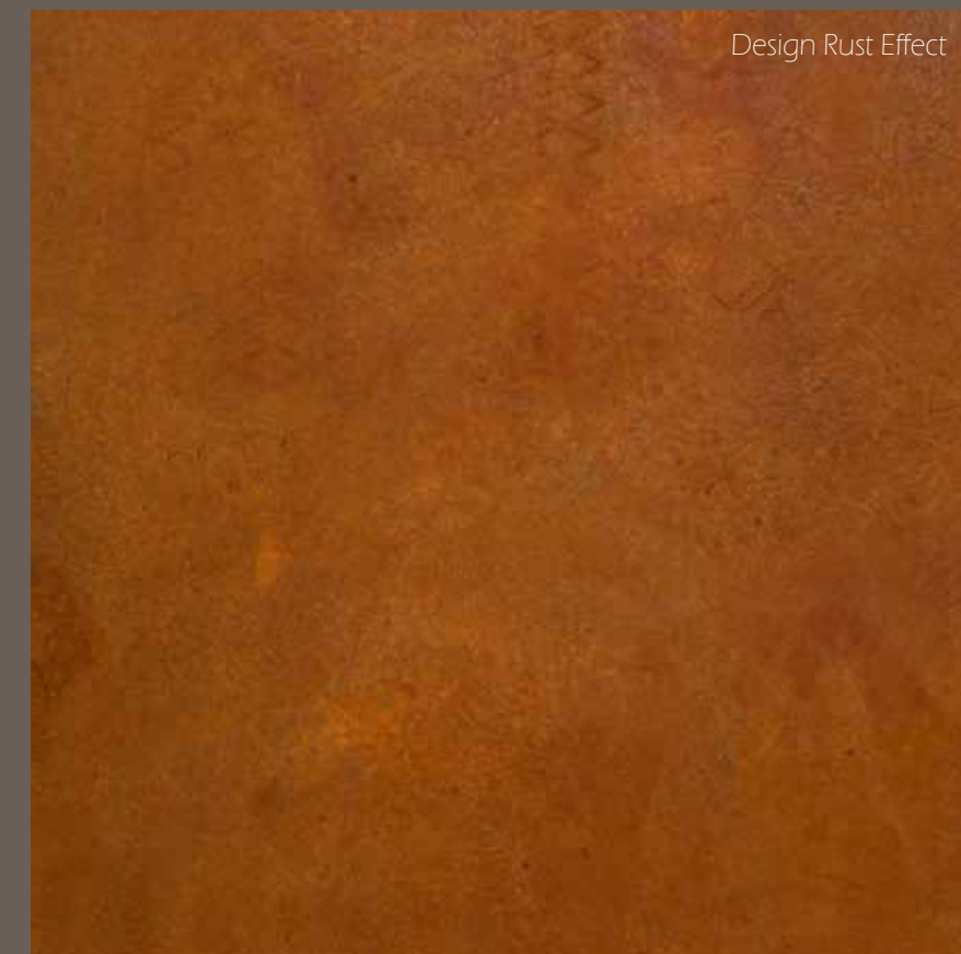
Design Rust Effect

Whether lively play of colour or homogeneous appearance: walls in rust optics are not only an outstanding eye-catcher, but also impress by combination with other surfaces.